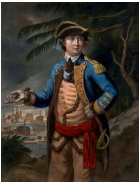
Figure 1. Thomas Hart, "Colonel Arnold: who commanded the Provincial Troops sent against Quebec, through the wilderness of Canada and was wounded in that city, under General Montgomery" (1776).

Benedict Arnold (1740/41-1801) was a member of the Revolutionary generation whose life and legacy took a different turn from the men with whom he was most