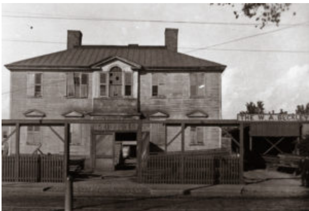
Figure 7. Benedict Arnold’s house in use as a lumber storage facility by the W. A. Beckley Company, circa 1900.

After Arnold’s defection in 1780 and later his death in London in 1801—barely noted on either side of the Atlantic—the New Haven house remained somewhat of a local landmark. In 1890, towards the end of the house’s existence, the New Haven Register described “some grey-haired citizens who remember it when it was one of the show places of the town . . . with an orchard, and grounds laid out in handsome terraces.” Perhaps the house appeared as it does in a romanticized nineteenth-century painting that is in the collection of the Second Company, Governor’s Foot Guard (which Arnold once captained). It depicts him standing in contrapposto in front of the house, gingerly keeping weight off his right leg, wounded for the second time at Saratoga. The same journalist noted that the house had a “highly ornamented English style wallpaper” which could be seen under layers of more paper. Not surprisingly, during the era of antiquarianism and the Colonial Revival, the Arnold house became a site for relic hunters.