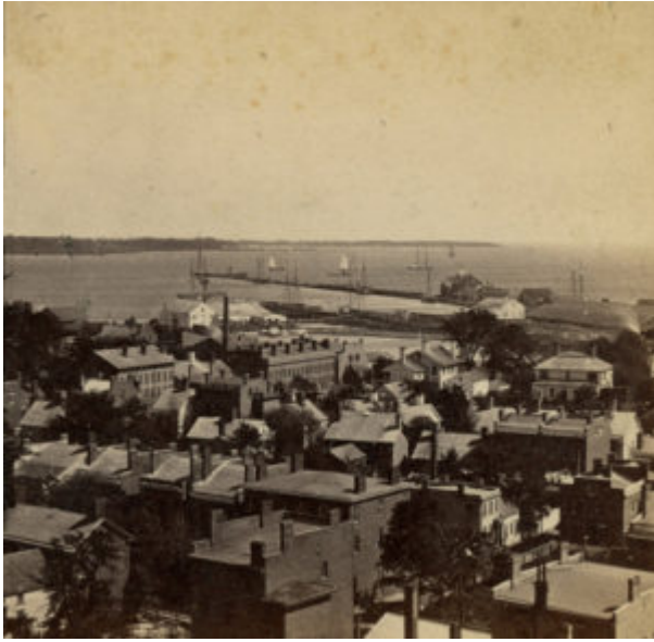
Figure 4. Stereoscopic view of Long Wharf and New Haven Harbor. Benedict Arnold's House appears in the back right of the image.

Arnold's attempt to craft a genteel life for himself is demonstrated when looking at the details of the house itself, as first seen in a photographic postcard from the last quarter of the nineteenth century. (Figure 5) Built before the American Revolution and part of the British Atlantic World, it was a large wood-frame eighteenth-century house with a hipped roof, fanlight over the doorway, and central Palladian window. There were unusual Greek Revival decorative details over the windows and the flat area of the roof likely had an addition called a monitor. Some architectural historians question the mix of details and suggest it may have been "Federalized" in the 1790s, perhaps by Noah Webster while the author of the first American dictionary wrote several chapters of his massive work in the front rooms.