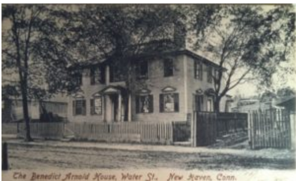
Figure 5. Postcard of the Benedict Arnold House on Water Street, New Haven, Connecticut.

Arnold's attempt to craft a genteel life for himself is demonstrated when looking at the details of the house itself, as first seen in a photographic postcard from the last quarter of the nineteenth century. (Figure 5) Built before the American Revolution and part of the British Atlantic World, it was a large wood-frame eighteenth-century house with a hipped roof, fanlight over the doorway, and central Palladian window. There were unusual Greek Revival decorative details over the windows and the flat area of the roof likely had an addition called a monitor. Some architectural historians question the mix of details and suggest it may have been "Federalized" in the 1790s, perhaps by Noah Webster while the author of the first American dictionary wrote several chapters of his massive work in the front rooms.