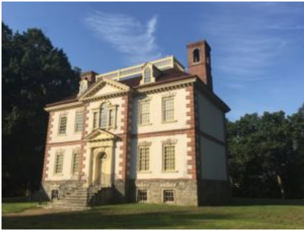
Figure 6. Mt. Pleasant, Fairmont Park, Philadelphia in 2019.

“employed their houses in precise ways across a range of settings to project power and define status.” In other words, building a gentlemen’s house and marrying a woman from a solid New Haven family provided Arnold with the respectability that he did not have in Norwich. As a young man, Arnold would often bring his inebriated father home from the tavern; everyone in town knew him as the son of a drunk. In New Haven, Arnold became a prosperous—if argumentative—town leader, elected to the high-status Freemasons and accepted as a member of the oldest church which dated to the town’s 1638 founding. Although neither a floor plan nor interior images of the house survive, tantalizing hints remain of what the interior may have looked like during Arnold’s life. A few architectural elements such as a lock and key, a doorknob, and a mantel exist at the New Haven Museum, the last of which was reused in an office space when the current Colonial Revival structure was built in 1930.