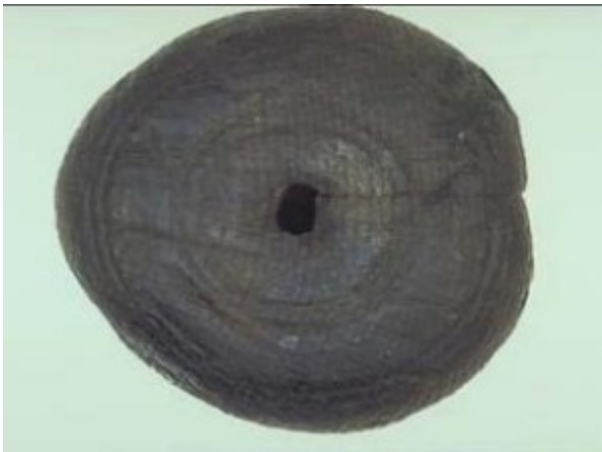
Fig. 1. North America's Oldest Bowling Ball, courtesy of the Massachusetts Historical Commission, Office of the Secretary of the Commonwealth, Cross Street back lot site, Boston.

Fewer people know about the little digs that preceded Boston's Big Dig. Following federal guidelines, the Central Artery project allotted roughly four million dollars in the early 1990s for archaeological explorations in areas thought to be rich in early history and likely to be destroyed by construction. Ultimately four sites were chosen. One of the four, a patch of asphalt shaded by the old elevated highway, became known as the Cross Street back lot. Here archaeologists uncovered a seventeenth-century privy and in the privy an astonishing treasure—an artifact identified in Massachusetts' new Commonwealth Museum as "North America's Oldest Bowling Ball."