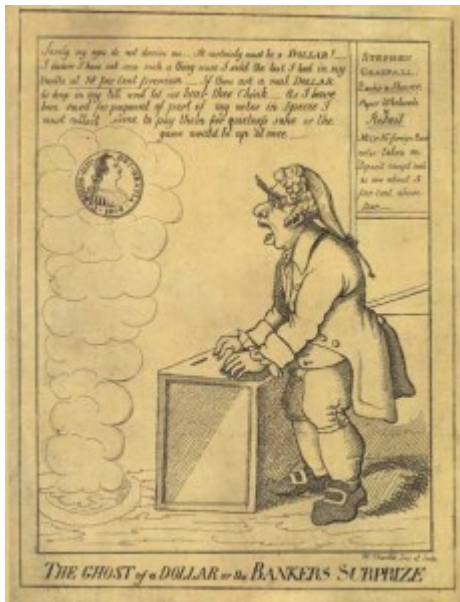
"The Ghost of a Dollar or the Bankers Surprise" by William Charles, 1813.

The ratification of the Constitution in 1788 considerably strengthened America's political union. The national government gained the power to tax citizens directly and to enact tariffs. States lost the right to lay tariffs on goods imported from other states and also the power to emit legal tender paper money. With passage of the Mint Act in 1792, the United States established a bona fide monetary union by defining a uniform unit of account, the dollar, in terms of both gold and silver (to be precise, 371.25 grains of pure silver or 416 grains of standard silver or 24.75 grains of pure gold or 27 grains of standard gold).