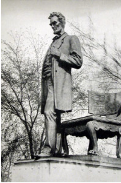
Fig. 1. Standing Lincoln, monument in Lincoln Park, Chicago: Augustus Saint-Gaudens, sculptor; Stanford White, architect.

After some toiling, the students voiced their opinion of the assignment, "This is too hard," "Is this Old English because I don't understand it at all?" and, of course, "I just don't get it!" Frazzled, I ran from group to group trying to help, but realized that I was really just telling them the answers. That evening, reflecting on the failure of my lesson, I tried to think of what my professor did that made my learning experience so different.