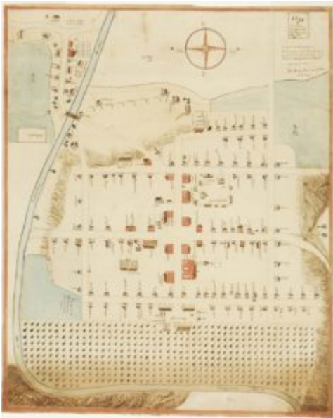
Figure 3: Harmony, Pennsylvania, as drawn by Wallrath Weingärtner in 1833. Wallrath Weingärtner, Public domain, via Wikimedia Commons .

attempts, that crested in the textile union movement's activities and failures in the American South between the 1930s and 1950s. In the background of this work stood the subsequent narrative of the civil rights movement, which, however partial its victories, however embattled those victories remain, provides something like a positive narrative line. Winners typically tell their stories. Losers typically don't. "Community" always involves risk.