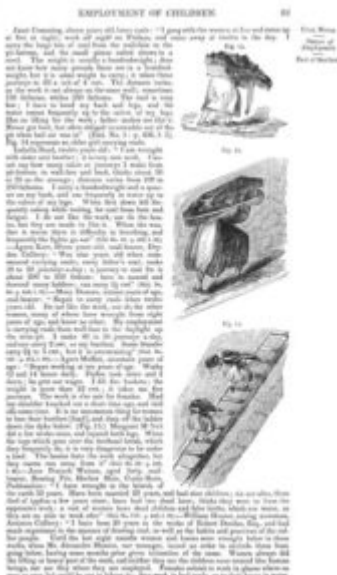
Royal Commission of Inquiry on the Employment of Children, from the British Parliamentary Papers (1842), p. 93.

While social knowledge is often studied through the optic of science (sociology, anthropology, and economics) or the contributions of famous social cartographers (Henry Mayhew, Jacob Riis, and Charles Booth), the nineteenth-century knowledge apparatus consisted of a mammoth record of increasingly bureaucratized information in which the state figured prominently. Together with special investigations responding to occasional exigencies, governments established permanent tools for measuring society. These included the ever-more detailed national census, statistical bureaus, or the annual reports submitted by governmental departments. Reform organizations also unleashed an immense volume of periodic literature to the reading public.