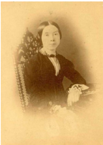
Fig. 3. New Emily Dickinson photograph.

The wait for the item seemed endless, but I finally received it nine days later. It looked good. From the type of paper and the quality of the image, I could tell that it was an unmounted albumen photo, clearly not a facsimile.