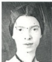
Figure 6. Landmarks selected for comparison.