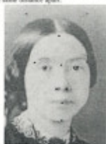
Figure 2. Landmark locations on the suspected image when scaled to the known photograph's inter-pupil distance.

Based on our analysis, the photographs do exhibit a consistent pattern and relationship between the identified cranial landmarks and gross morphological features. The possible age separation between the individuals in these photographs might explain these slight differences. Overall, the images are consistent, and we are unable to exclude the individual in the suspect photograph.