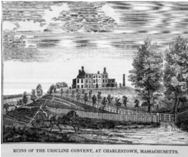
Figure 3: Ruins of the Ursuline Convent, at Charlestown, Massachusetts