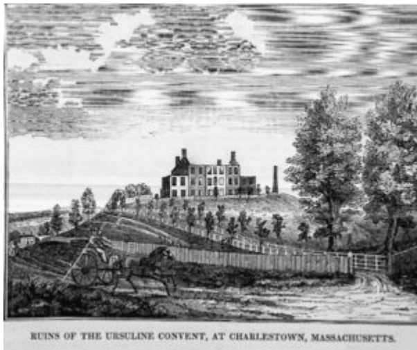
Figure 3: Ruins of the Ursuline Convent, at Charlestown, Massachusetts