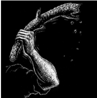
Our Special Artist

flailing arms and the jags and dashes of torn turf and flesh—didn't want to risk a blow from a misaimed club or a bite from a wounded cur."