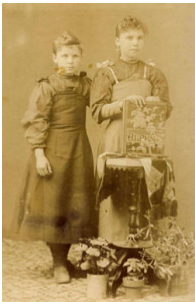
Fig. 1. Embossed albums used as scrapbooks were often valued possessions. Girls