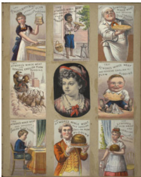
Fig. 3. Advertising card scrapbook. First page of a scrapbook, ca. 1880. Scrapbook and Graphic Arts Collection at the American Antiquarian Society. Gift of Nancy and Randall Burkett, 2006.

From our point of view the books were quite unreadable and almost pitifully useless . . . It didn't seem possible that so many books should be published with absolutely nothing in them. They were full of pictures, and that was promising, for naturally one expects the presence of pictures to indicate literature of the lighter sort. But such pictures as they were when you came to look at them! Common bugs in all stages of unbeautiful growth; worms only less ugly than in life; hens, mere hens, standing up to have their pictures taken . . . You opened up a nice, shiny, infolded sheet, evidently intended in creation for a beautiful picture, and found it held only drawings of windmills or churns.