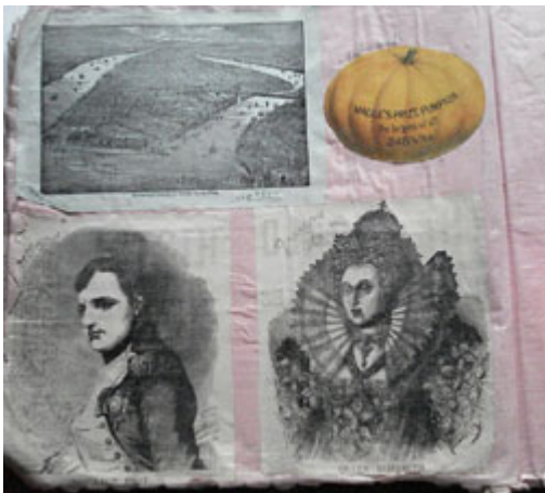
Fig. 2. Cloth scrapbook. Children and young people made scrapbooks from the colorful and elaborate advertising cards that proliferated in the 1880s.

In this account, pictures are decidedly inferior objects—just one step up from wastepaper, entirely for the amusement of the preliterate child. The description accords with the evidence. It was common in the nineteenth century to make cloth scrapbooks—as durable as today's board books—for young children and to fill them with pictures from seed catalogs, advertising cards, and other sources (fig. 2). Children and young people also made scrapbooks from the colorful and elaborate advertising cards that proliferated in the 1880s (fig. 3). But scrapbooks created to save newspaper and magazine items often used few of the pictures from those publications. Perhaps pictures undercut the seriousness of a homemade object that mimicked the look of a book or newspaper.