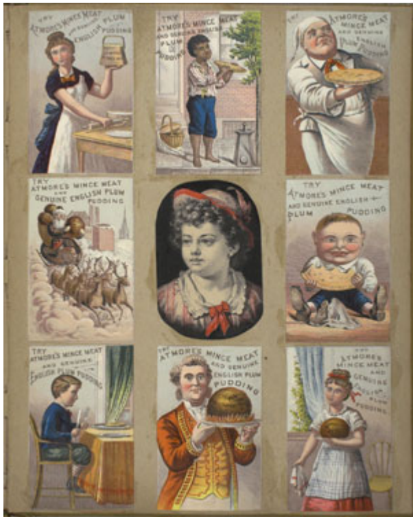
Scrapbooks and extra-illustration