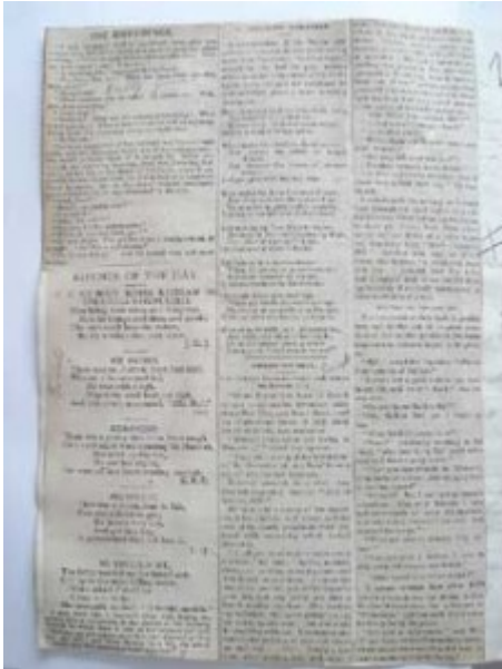
Fig. 4. Typical U.S. newspaper scrapbook, circa 1880s.

her. The poets she read spoke of flowers she had never seen, and she asked, "Who had ever heard of the Missouri in a novel or a poem?" At least she could collect poetry she admired in the local press and obliterate the hens and worms with it. In other words, in her scrapbook she physically replayed literature's ability to carry her away from churns.