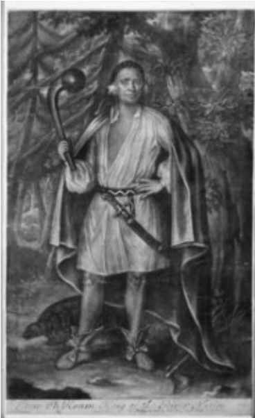
Etow Oh Koam, King of the River Nation, mezzotint, engraved by John Simon, after painting by John Verelst. 16 1/4 x 9 3/4" (London, 1710).