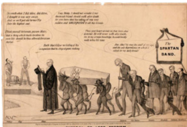
"Funeral of Loco Focoism," lithograph by Edward Williams Clay, published by John Childs (New York, 1841). Click image to enlarge in new window.

Once the Democratic Party accommodated an infidel in its ranks, the door was open to attract other religious outsiders and immigrants. Assuming that future Archbishop of New York John Hughes expressed the general opinion of Catholic immigrants in the United States, it becomes clear why his fellow believers found a home in the Democratic Party. In a debate defending his faith and foreign birth against doubts about his allegiance to the United States, Hughes declared, "I am an American citizen—not by chance ,—but by choice ." Choosing one's allegiance, in this calculation, ensured civic virtue. The ultimate expression of this view from the Democratic perspective, one that elevates this position to one of nearly religious import, appears in Secretary of State Lewis Cass's opinion from the late 1850s that naturalized and native-born United States citizens were fundamentally equal. According to Cass, "The moment a foreigner becomes naturalized, his allegiance to his native country is severed forever. He experiences a new political birth." For Cass, immigrants expressed their political free will by becoming citizens.