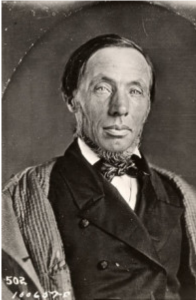
Robert Dale Owen.

Congressional candidates inspired by the spirit of Robert Dale Owen in the twenty-first century would likely face considerable challenges, whether running in Indiana's Eighth or virtually any other district. The 113th United States Congress elected in 2012 was remarkable for its religious diversity, with members from some religious communities represented for the first time. Hawaiian voters were largely responsible for this development. They elected the first Hindu to Congress, who filled a House seat vacated by Mazie Hirono to become the Senate's first Buddhist. Outside the Hawaii delegation, two other Buddhists won re-election to the House in 2012 as did two Muslims, joining a body in which Jews are also fairly well-represented. Nevertheless, Congress remained majority Christian, with Catholics the largest single denomination. All of this according to "Faith on the Hill: The Religious Composition of the 113 th Congress," a recent report by the Pew Research Center's Religion and Public Life Project.