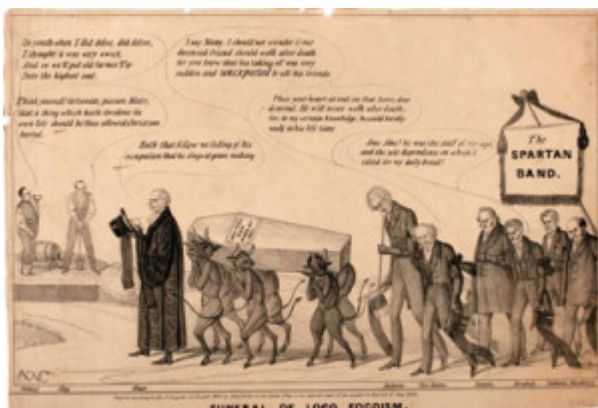
"Funeral of Loco Focoism," lithograph by Edward Williams Clay, published by John Childs (New York, 1841). Click image to enlarge in new window.

Once the Democratic Party accommodated an infidel in its ranks, the door was open to attract other religious outsiders and immigrants. Assuming that future Archbishop of New York John Hughes expressed the general opinion of Catholic immigrants in the United States, it becomes clear why his fellow believers found a home in the Democratic Party. In a debate defending his faith and foreign birth against doubts about his allegiance to the United States, Hughes declared, "I am an American citizen—not by chance ,—but by choice ." Choosing one's allegiance, in this calculation, ensured civic virtue. The ultimate expression of this view from the Democratic perspective, one that elevates this position to one of nearly religious import, appears in Secretary of State Lewis Cass's opinion from the late 1850s that naturalized and native-born United States citizens were fundamentally equal. According to Cass, "The moment a foreigner becomes naturalized, his allegiance to his native country is severed forever. He experiences a new political birth." For Cass, immigrants expressed their political free will by becoming citizens.