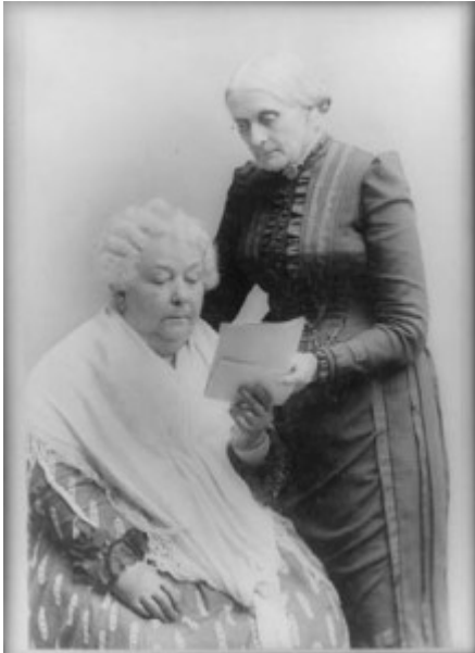
Fig. 1. Portrait of Susan B. Anthony and Elizabeth Cady Stanton, between 1880 and 1902.

halls of legislation” because they lacked the vote and, in cases of divorce, the one who cared for the children was determined “wholly regardless of the happiness of the women.”