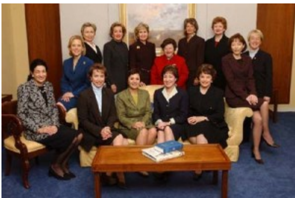
Fig. 2. The 108th Congress opens with a record fourteen women senators.