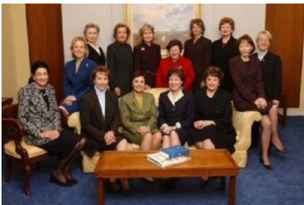
Fig. 2. The 108th Congress opens with a record fourteen women senators.