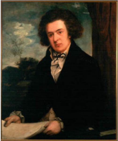
Fig. 2. Benjamin Smith Barton, painted by Samuel Jennings c. 1810