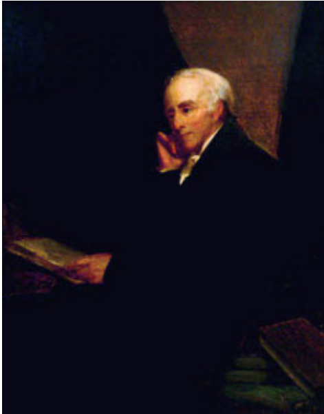
Fig. 3. Benjamin Rush, painted by Thomas Sully c. 1812-15