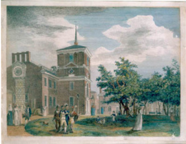
Fig. 4. View of Independence Hall and the State House Yard, by William Birch, 1799, courtesy of the American Philosophical Society

Atlantic world whose cultural centers were in Europe. Only a few years before, they had formally severed their political affiliation with their “brethren” in Great Britain, the strongest European imperial power of the period. While ties to Britain had come to represent a noose of political and economic oppression during the war years, ties to England were also the cultural and material lifelines for Anglo-American settlers. Many settlers believed that access to fine objects and refined ideas elevated them above the Indians and Africans who were now their near neighbors.