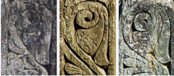
5. Collage showcasing details of several stones in Newport showing the work of William Stevens's workshop.

carver produced nothing that surpassed the Cuffe Gibbs stone in elegance or technique. Only after an additional decade of practice and experimentation as master of his own shop could Bull demonstrate such dazzling skill.