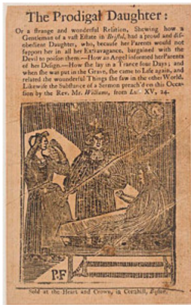
6. "The Prodigal Daughter Revived," Peter Fleet, woodcut, 1736. Courtesy Harvard Art Museums/Fogg Museum, Gift of Rona Schneider, M23577. Photograph: Imaging Department © President and Fellows of Harvard College, Cambridge, Massachusetts.

Perhaps it is not urgent for museum visitors to know the names of the apprentices and journeymen who chiseled Renaissance sculpture and painted backgrounds and silk gowns for Georgian portraits. But, in the context of early American decorative arts, common collecting and curatorial practice leads to exhibits that badly misrepresent labor history. It is true that art museums are not history museums. Nevertheless, they do make historical arguments. When artisan-made objects are attributed to a single, exemplary craftsman, rather than to a workshop, exhibits cement the dubious connection between artisanship and political independence, rather than subverting it. In truth, not all American-made objects were crafted by free, self-supporting artisans, nor even by the wage-paid European journeymen they employed or the white apprentices bound to them by indenture. Some luxury goods were made by slaves.