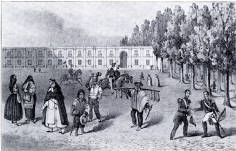
COSTUMES OF PERU IN 1820.