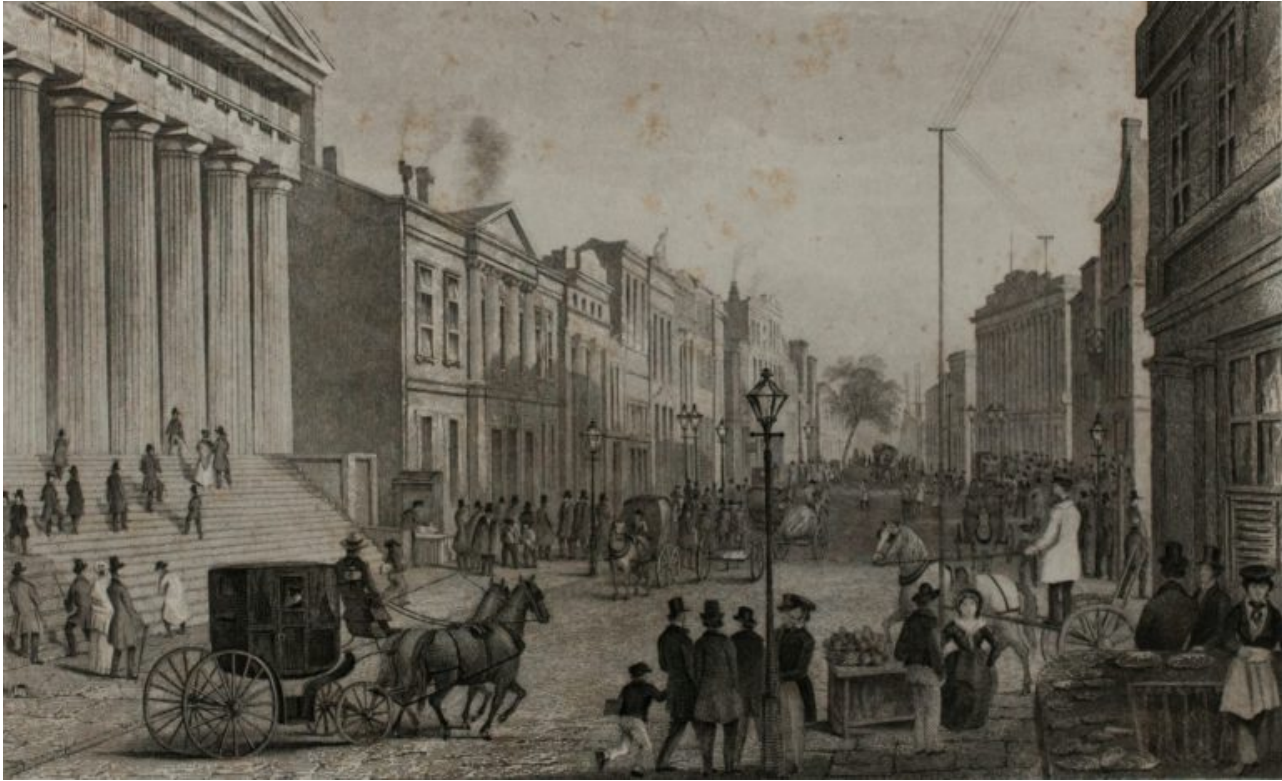
Harry Franco and Henry Ward Beecher in the antebellum market