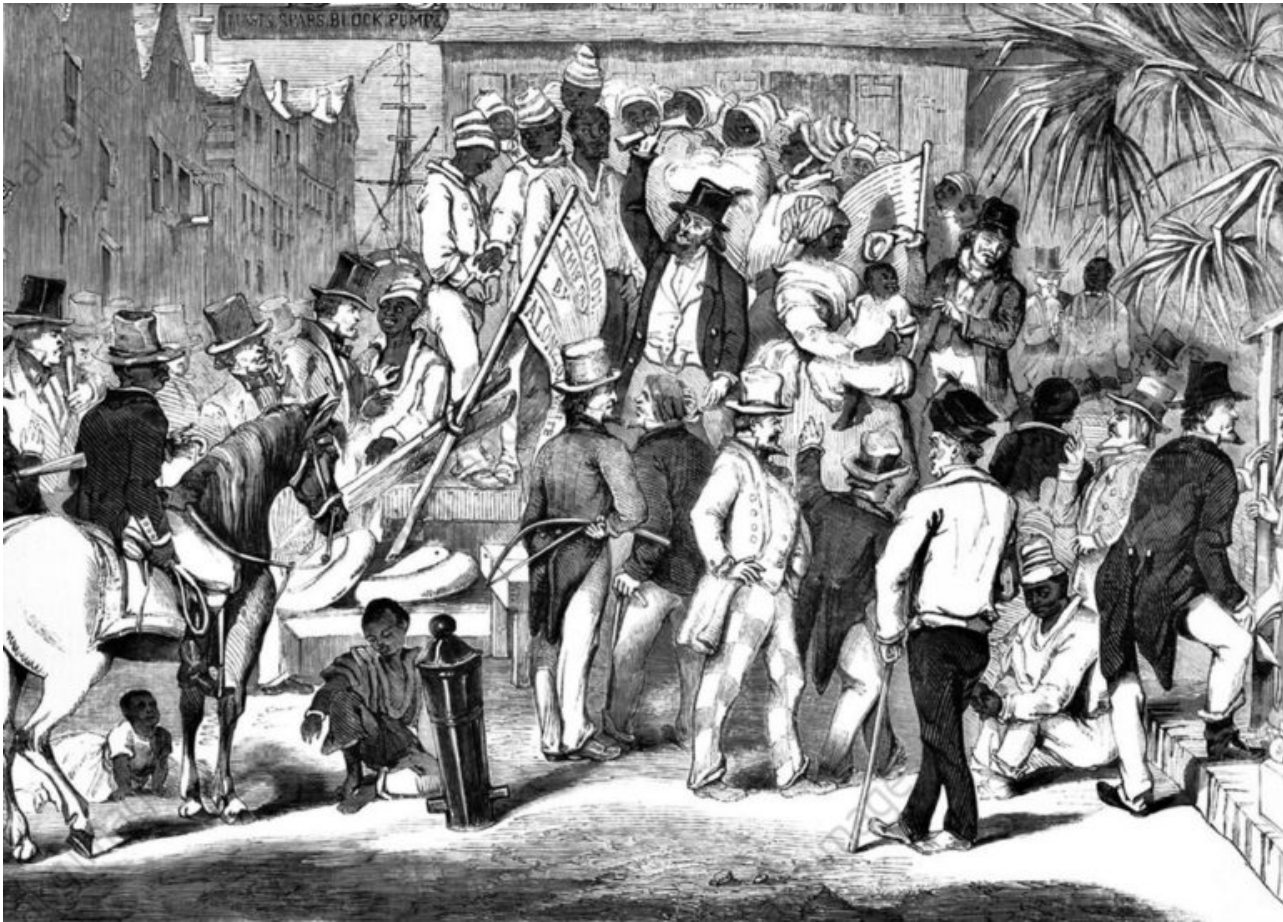
These versions of the Panic are capsules that carry other versions of the history of American capitalism into the bloodstream of historical consciousness.