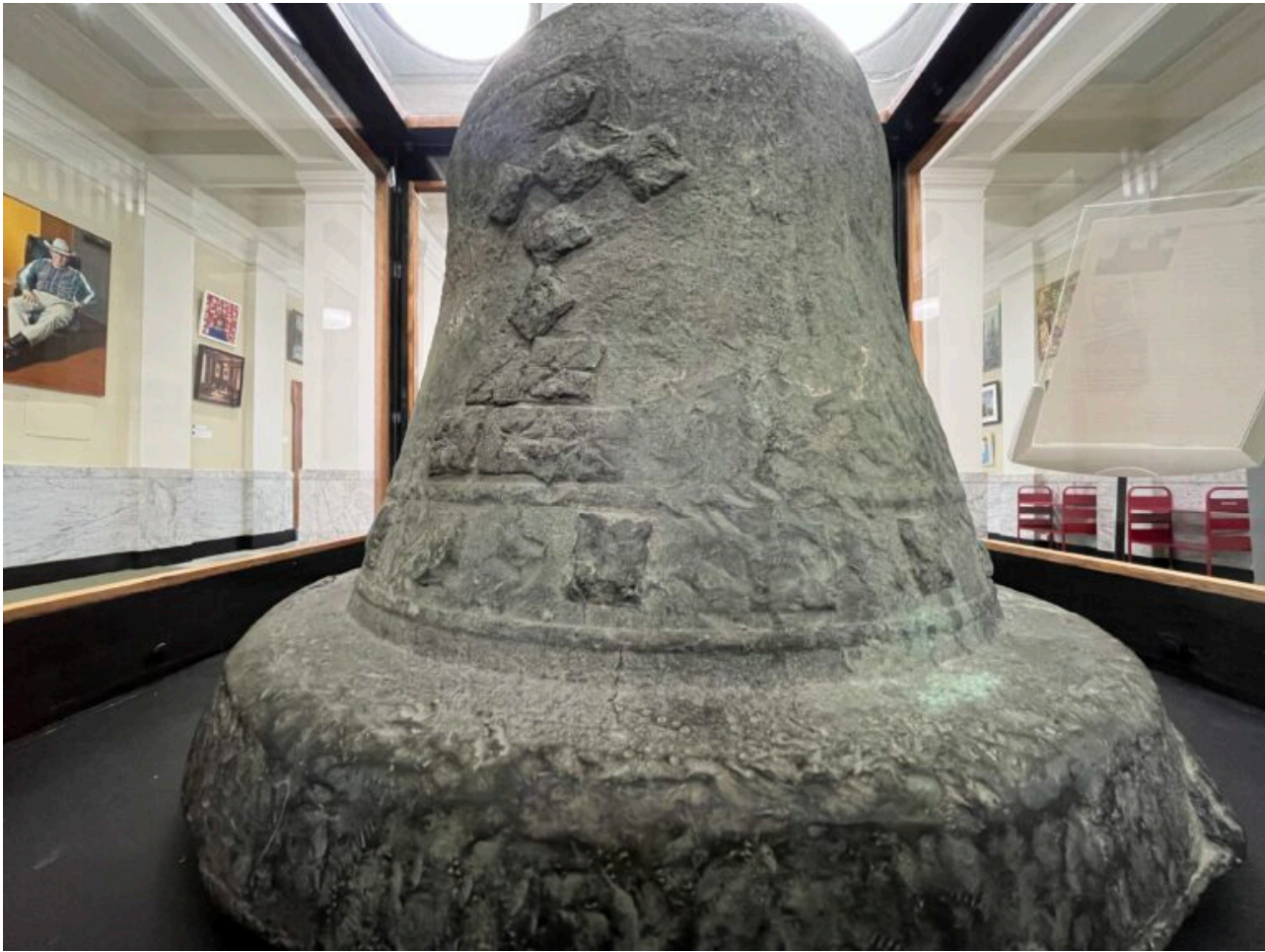
For those in later years, the bell's value lay not in its powerful sound, but in its visual representation.