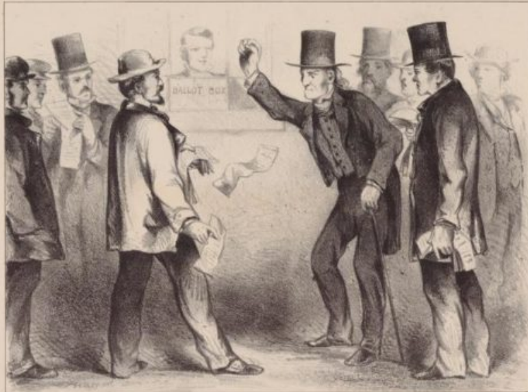
A THRILLING INCIDENT DURING VOTING.--18 TH WARD, PHILADELPHIA, OCT. 11.

An old man over seventy years of age advanced to the window, leaning tremblingly on his staff, when an officious copperhead vote distributor approached him and thrusting a ticket in his face said, "Here is an old Jackson Democrat who always votes a straight ticket." The old man opened the ballot and held it with trembling fingers until he had read one or two of the names, when he flung it from him with boiling, and in a voice hoarse with emotion, exclaimed: "I despise you more than I hate the rebel who sent his bullet through my dead son's heart! You miserable creatures! Do you expect me to dishonor my poor boy's memory, and vote for men who charge American soldiers, fighting for their country, with being hirings and mercenaries?"