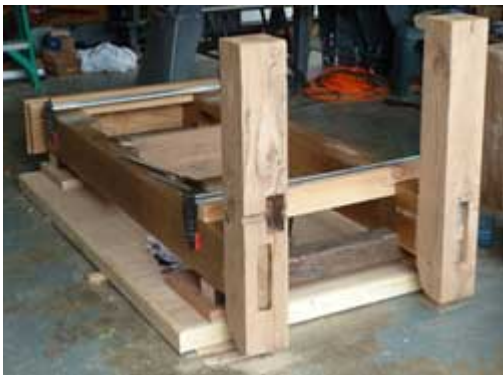
Fig. 8. The cheeks of the replica press locked up in jigs to keep the inner faces of the cheeks parallel to one another as I fitted pieces such as the head, till, and foot assembly.

Fourth, our printing-press maker would need a reliable source of hardwood that was adequately seasoned and sized when it arrived at the shop. The needs of a press maker in this respect would have varied from those of, say, a cabinet maker, as the dimensions of the wood for a cabinet and a press are very different. At the same time, the wood would have to be of higher quality than the timbers that might be used to frame a building, where knots, checks, and blemishes would be less difficult to work around. Such supply was not always forthcoming in the late eighteenth century; in 1792 Isaiah Thomas ordered presses from Hartford, "and when the manufacturers were unable to find good wood for them, he hunted it up in Boston." Some of this lumber may have been used rather than new. If so, the press maker would have to work around or