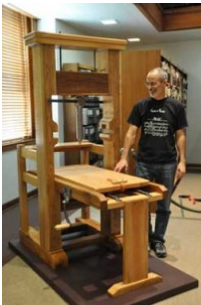
Fig. 9. The replica press in the Special Collections Reading Room, the Claremont Colleges Library, with the author standing next to it.