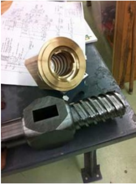
Fig. 7. The spindle and nut cut by my college machinist for the replica press. Note the three-start thread visible on the nut and the plans from Harris and Sisson's The Common Press in the background.