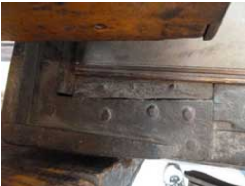
Fig. 4. A closeup, from above, of one corner of the coffin on the Thomas press. A repair has been made by setting and nailing a small piece of wood, visible just above the corner iron, into the coffin frame.

needed implements. While I did not set out to be true to eighteenth-century joinery practices in my use of tools (in fact, I regularly utilized a number of electric tools), I did do a great deal of the wood work on the replica with hand tools that would have been available to a London joiner in 1747. If I'd had back-to-back sabbaticals, I would have set up a forge and tried my arm at the anvil, but instead I used an arc welder and an oxygen-acetylene torch for my iron work. Additionally, the machinist at my college cut the spindle, nut, and a few other metal pieces that were simply beyond my abilities. With my shop set up, I then began to look for vintage wood to use in the construction. Common presses were typically constructed out of a mix of hardwoods, and some hardwoods have the unfortunate tendency to twist and check as they dry. For this reason, Moxon strongly advises press builders to use "Well-season'd Oak." After some searching, I found a vintage-wood dealer who had appropriately sized timbers of oak and elm, and I supplemented those with a few pieces of relatively new but nonetheless dry and stable wood. My "well-season'd" lumber had come out of old barns and other structures; most of the pieces had tenons or mortises cut into them that I had to work around or incorporate.