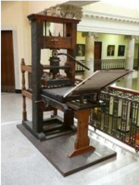
Fig. 1. The Isaiah Thomas printing press, built in London in 1747, restored to its present condition in 1977, and now resident at the American Antiquarian Society, Worcester, Massachusetts.

decades. In 1796 he compiled an inventory of his by-then large shop, and in that document he referred to the press as “No. 1.” Notably, he also listed it as “old,” which may imply that the press was little used or even retired. In 1812, Thomas founded the American Antiquarian Society in Worcester, Massachusetts, and in 1830 he wrote a codicil to his will that left his then disassembled press to the Society. Thomas died in 1831.