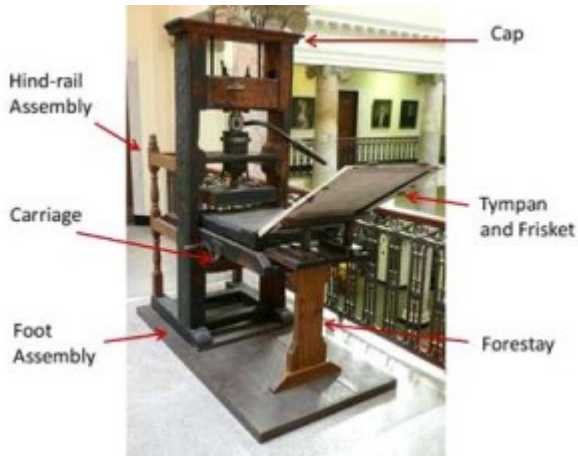
Fig. 2. Selected parts of the Thomas press.