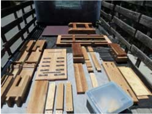
Fig. 6. The parts of the replica spread out on the bed of a truck, waiting to be hauled to the library for assembly.

By 1800, numerous newspaper advertisements demonstrate that being a “printers’ joiner” or “printing-press maker” had become a small but specialized American trade. A press maker from Elizabethtown, New Jersey, offers a sense of the growing market for native presses in an informative advertisement in the New Jersey Journal in 1796: