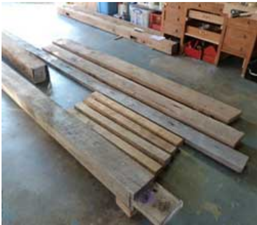
Fig. 5. Vintage wood in my garage: the raw material for my replica.

Repairing, disassembling, and reassembling a press, then, were relatively straightforward endeavors. Building a press from scratch, however, was a different matter, and the complexities of coordinating supply and craftwork was a significant barrier to native production until after the Revolutionary War, even though the demand for presses was growing. As with the Thomas press, colonial printers had generally imported their machines from England, and as Milton W. Hamilton notes, presses “made in America did not become common until the non-importation agreements of the struggle over taxation gave an impetus to colonial manufacturing.” Evidence of native production prior to the war is scarce. In his History of Printing in America , Isaiah Thomas dates the earliest press construction in North America to 1750, when Christopher Sower Jr. of Germantown had several presses made for his own use. In 1769, a New Haven clock maker ventured beyond his usual scope of business to build a printing press for an American printer. Around the beginning of the war, press production seems to have developed in Philadelphia, Hartford, and perhaps a few other places. By the 1790s, native press makers were supplying a large part of the market and advertising their manufactures widely. Of the twelve presses listed in Isaiah Thomas’s 1796 inventory, four were made in Hartford.