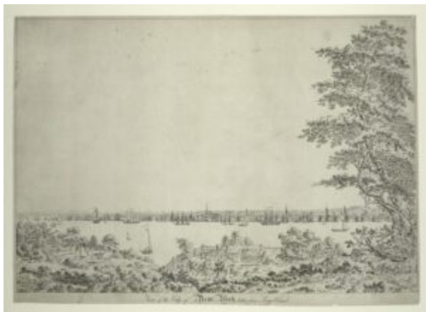
Figure 1: New York in 1796. Charles Balthazar Julien Fevret de Saint-Mémin, View of the City of New York Taken from Long Island (1796). From the New York Public Library .

The evening of November 5, 1796, was especially lively in New York City. Guy Fawkes Night was still observed in New York after independence as a kind of Hallowe'en, and the streets were filled with revelers.