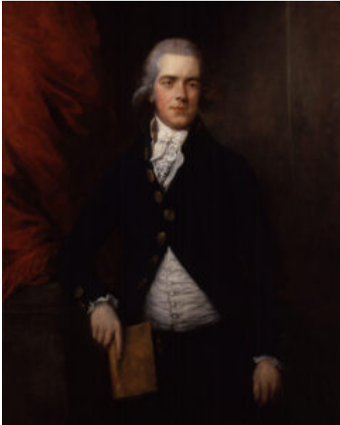
Figure 7: Lord Grenville, British Foreign Secretary in 1796. Gainsborough Dupont, Public domain, via Wikimedia Commons .

There, in 1771, Temple used the threat of publishing his letters on the Stamp Act to blackmail Thomas Whately (who had taken the followers of the late Prime Minister George Grenville over to Lord North), into creating the post of inspector-general of customs for England for him. Temple enjoyed this sinecure until 1773, when the Massachusetts House of Representatives published sixteen private letters between Thomas Whately (who had died in 1772) and Governor Thomas Hutchinson and Lieutenant Governor Andrew Oliver. The letters were political dynamite. The Massachusetts legislature petitioned the king to dismiss Hutchinson and Oliver. In England, Thomas Whately's banker brother, William, suggested that Temple might have taken the letters from his late brother's files. Temple took umbrage at this and challenged the banker to a duel. It was bloody and inconclusive. To head off another duel—and to protect his real source—Benjamin Franklin published an admission that he had been the one to purloin the letters. The result was that both Franklin and Temple lost their government jobs, and Parliament was in a vindictive mood when news arrived of the Boston Tea Party.