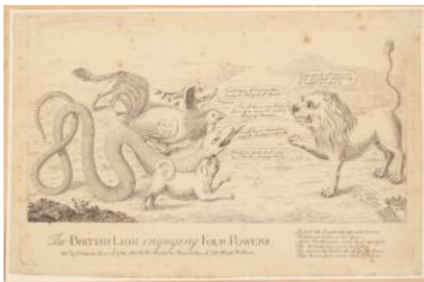
Figure 4: Print shows a lion confronting a spaniel, representing Spain, a fighting cock, representing France, a rattlesnake, representing America, and a pug dog, representing Holland. British Lion Engaging Four Powers (London: J. Barrow, 1782). Photograph. Library of Congress .

Lord Grenville must have been appalled that Temple had sought the indictment. Whatever his private feelings about the United States, the foreign secretary certainly did not want anything to exacerbate the already chilly relations between the two governments. Britain was in a desperate war with revolutionary France, and Grenville was trying to keep the United States neutral. A Senate hearing on an incident in which a British diplomat had horsewhipped one of its members was not what the foreign minister needed. Nevertheless, Grenville never mentioned the matter in his official letters to Temple nor to the new British minister to the United States Robert Liston.