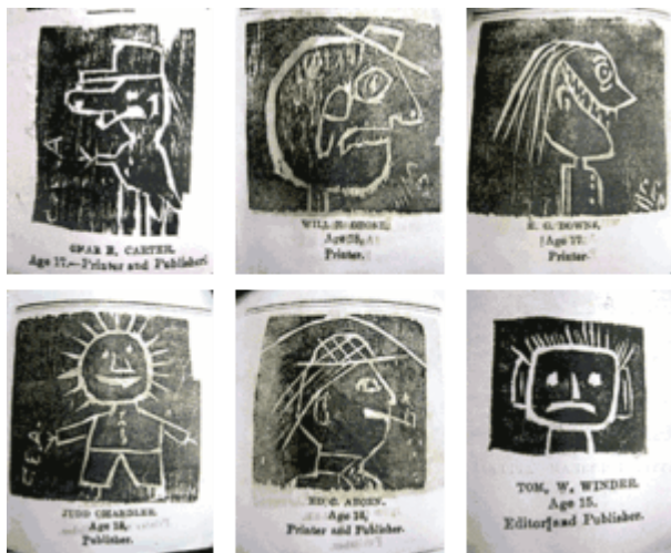
Fig. 7 Warsaw Amateur Directory (Warsaw, Ind.: Aborn & Winder, 1877).

The amateurs’ desire to put their rebelliousness on display, even amidst their indisputable propriety, appears quite graphically on the cover of the 1875 Amateur Directory from Grand Rapids, Michigan (fig. 8). The first thing to note about this scene of amateur printing is how unlikely it is. Editors sometimes made space for their presses on dining room tables or in bedrooms; lucky ones wrote of repurposing disused sheds. But a capacious room devoted to presswork, complete with full-size composing table and imposing desk, was unheard of. Perhaps the most startling aspect of this imagined scene of production, however, is the painting hanging on the wall on the left. Apparently of two figures in a fistfight, its crude lines and combative subject seem out of place in the tidy domestic setting. Its very incongruity, though, makes a striking figure of amateurdom’s ornamental unruliness. Indeed, the illustration’s depiction of the comfortable home that such rebellion finds within scenes of middle-class propriety suggests that amateurdom’s oppositional postures may actually work in tandem with its conservatism, as much as in tension with it.