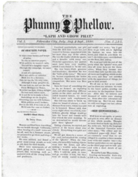
Fig. 12 Phunny Phellow (Nebraska City, Neb.), Vol. 1, Nos. 3, 4, and 5 (July, August, and September, 1880).

12). The unusually proficient engraving of the masthead, as well as the oversize ears, lips, and teeth all too familiar from minstrel caricatures, indicates that its self-portrait in blackface might have been intentional, rather than accidental—a way of rendering what the paper elsewhere called the “naughty caper” of amateurdom.