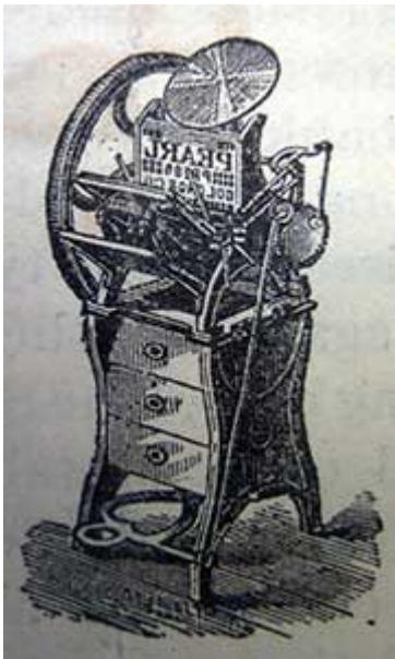
Fig. 1b Advertisement for hobby printing presses: Golding Junior Press, 1879.