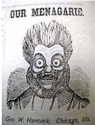
Fig. 6c Woodcuts of amateur journalists; Geo. W. Hancock in the Amateur Iowan (Washington, Iowa), Vol. 1, No. 1 (January 1878).

The poem emphasizes the hazards of adolescence, “the perilous time of youth,” before realizing “But thank Heaven!—there’s one class of boys / who glean from youth more than transient joys!” The poem’s enthusiasm over this discovery is so intense that the final line, which reveals the identity of these boys, ruptures the previously neat pattern of rhyming couplets, bursting out “THE AMATEUR JOURNALIST!” It’s tempting to read this as an allegory for the mode of the amateur journalist himself—formally disruptive but tremendously staid in content.