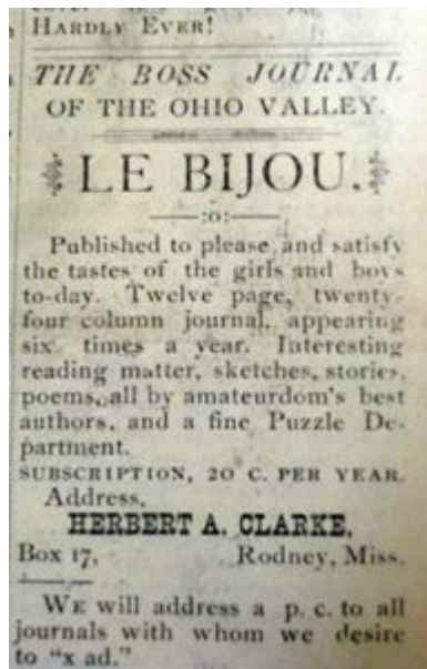
Fig. 10 Advertisement for Le Bijou (Cincinnati, Ohio), Vol. 2, No. 2 (March 1879).