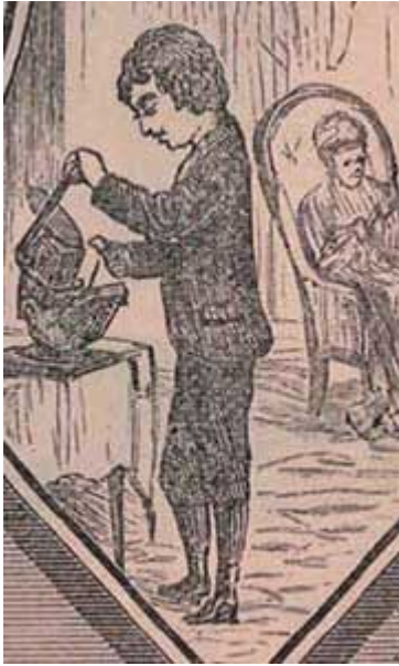
Fig. 1a Advertisement for hobby printing presses: Novelty Press, 1870s.