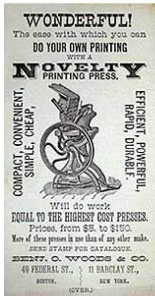
Fig. 1c Advertisement for hobby printing presses: Columbian Press, ca. 1875.

Given how boring the results were, what led amateurs to start newspapers? No one, it seems, started an amateur newspaper because he—and it was almost always he—had something to say. The contents of the papers are unrelievedly repetitive of one another. Instead of creating an outlet for one's own thoughts, it appears that one started an amateur newspaper to join a community of other amateurs. This community is not just an effect of print, as has often been argued of other print cultures. Community is also the cause of print. Thus while amateur newspapers often address themselves to what they termed "the boys and girls of America," their actual audience largely seems to have consisted of other amateurs. The amateur press's distribution methods more or less ensured this. The majority of the papers were distributed through an old-fashioned exchange system that hearkened back to the late eighteenth century: one editor would write to another requesting an exchange, and before long editors developed standing exchange arrangements (fig. 3). Amateur editors often accused other papers of being what they called "exchange frauds," or papers got up solely to obtain exchanges from other papers. But arguably, these accusations masked the fact that such practices were less exceptional than normative. To a certain extent, all amateur papers only existed to exchange.