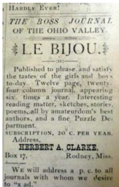
Fig. 10 Advertisement for Le Bijou (Cincinnati, Ohio), Vol. 2, No. 2 (March 1879).