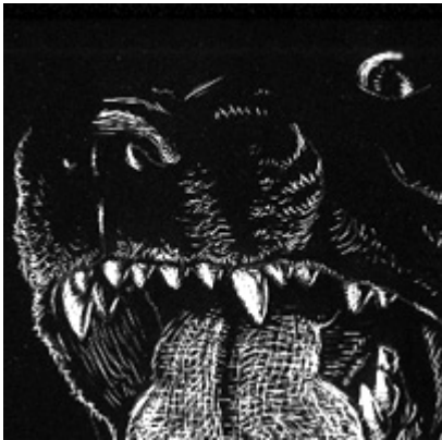
The Canine Letter