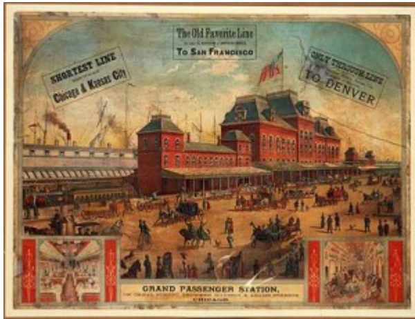
Fig. 3. Railroad poster: Grand Passenger Station on Canal Street between Madison and Adams, Chicago, Ill.