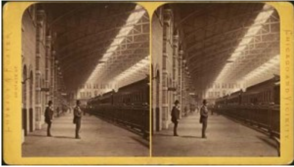
Fig. 4. Stereograph: Interior View, Lake Shore and Michigan Southern Railroad Depot. Photograph by Lovejoy & Foster. Courtesy of Chicago Historical Society, IChi-05326.