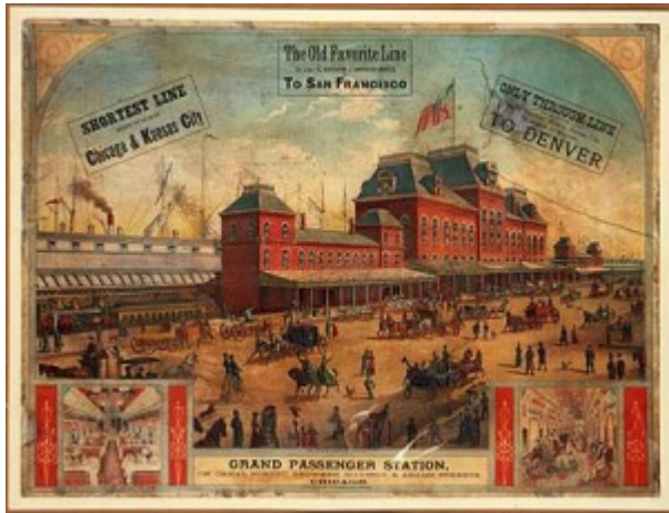
Fig. 3. Railroad poster: Grand Passenger Station on Canal Street between Madison and Adams, Chicago, Ill. Courtesy of Chicago Historical Society, ICHI-35603.