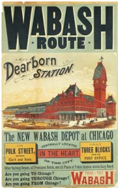
Fig. 2. Lithograph: Wabash Route Dearborn Station. Advertisement for the New Wabash Depot at Chicago, Polk Street between Clark and LaSalle. Courtesy of Chicago Historical Society, ICHi-05257.