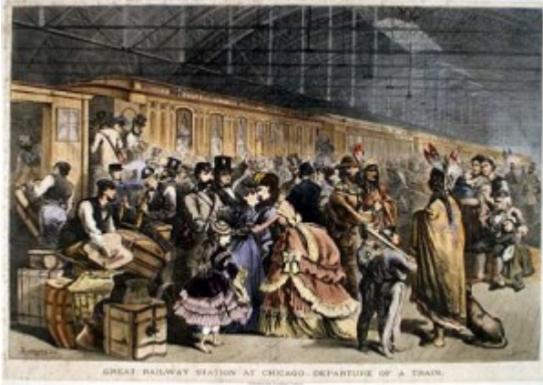
Fig. 1. Engraving from Appleton's Journal, 1870: Great Railway Station at Chicago—Departure of a Train.