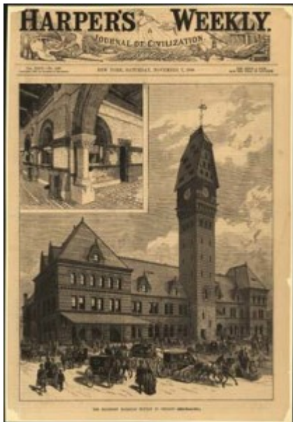
Fig. 5. Cover of Harper's Weekly, November 7, 1885: The Dearborn Railroad Station in Chicago.

that stepping out of the train as a teenager into “the hurly-burly” of Chicago made him feel “as though I were ready to conquer the world.” Herrick, in contrast, called the “huge spider’s web” of railroad lines “a stupendous blasphemy against nature.” Once within the city, Herrick advised, “the heart must forget that the earth is beautiful.”