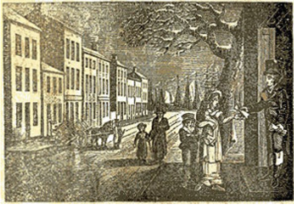
Fig. 1. Destitute family in New York City. Frontispiece, New-York Scene's [sic]: Designed for the Entertainment and Instruction of City and Country Children (New York, 1833).

Almost in spite of itself, New-York Scenes also communicated excitement and delight about the city. If New York was pockmarked with sin and vice that would teach important lessons, it was also sprinkled with fascinating sites, especially for kids (fig.2). After detailing the “charming promenade fronting the Bay of New-York,” the little book posited that “children from the country would gaze with wonder at the numerous vessels, entering and leaving the harbor, and sailing in every direction. The steamboats, too, form an additional interest to view from this spot.”