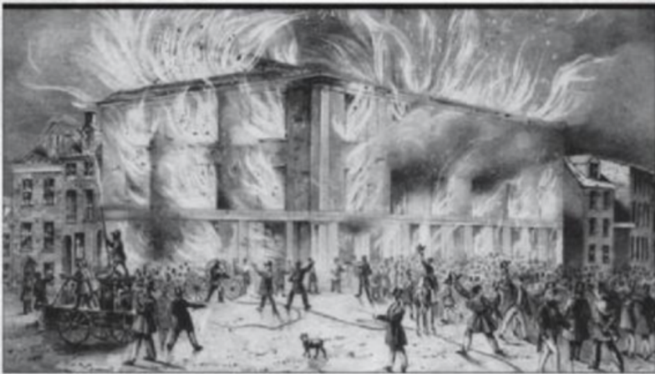
DESTRUCTION BY FIRE OF PENNSYLVANIA HALL. The New Building of the Abolition Society, on the night of the 17th of May.

ry for the preservation of the republic—the failure of the Unionists' efforts to establish a stable and lasting representative government. For many Americans in the North and the South, disunion was a nightmare, a tragic conclusion that would reduce them to the level of fire and sword that seemed to pervade the rest of the world. And yes, for many other Americans, disunion