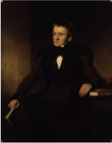
Figure 3: Thomas De Quincey, author of Confessions of an English Opium-Eater. Poe read the memoir and believed that De Quincey's style was worth emulating. Thomas De Quincey, circa 1845.