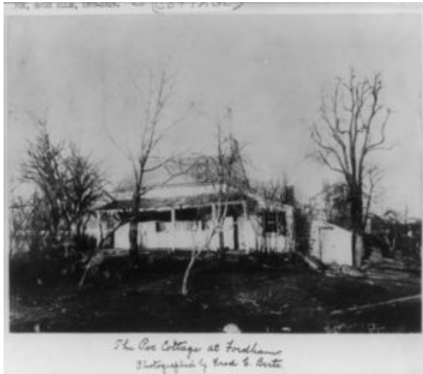
Figure 4: The Poes' home in Fordham, New York, where his sister Rosalie visited him and Virginia.