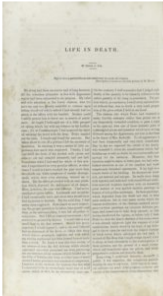
Figure 2: “Life in Death” was one of Poe’s tales that featured an opium habitué as the narrator. “Life in Death” published in Graham’s Lady’s and Gentleman’s Magazine 20, no. 4. (April 1842): 200-201.