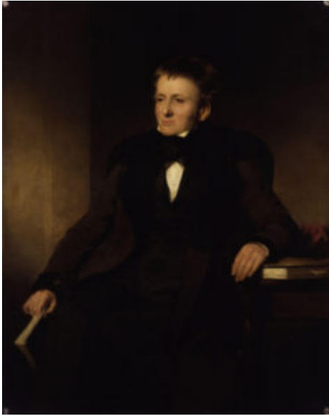
Figure 3: Thomas De Quincey, author of Confessions of an English Opium-Eater. Poe read the memoir and believed that De Quincey's style was worth emulating. Thomas De Quincey, circa 1845.