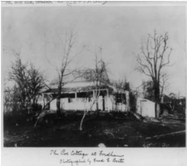
Figure 4: The Poes' home in Fordham, New York, where his sister Rosalie visited him and Virginia.