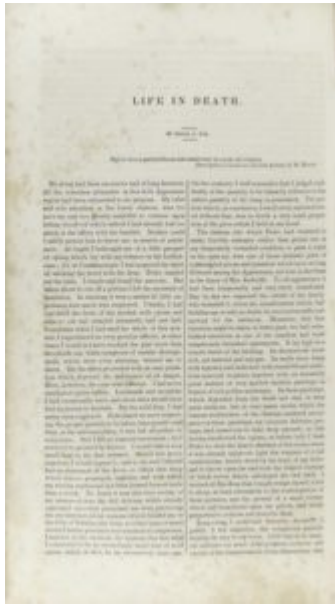
Figure 2: “Life in Death” was one of Poe’s tales that featured an opium habitué as the narrator. “Life in Death” published in Graham’s Lady’s and Gentleman’s Magazine 20, no. 4. (April 1842): 200-201.